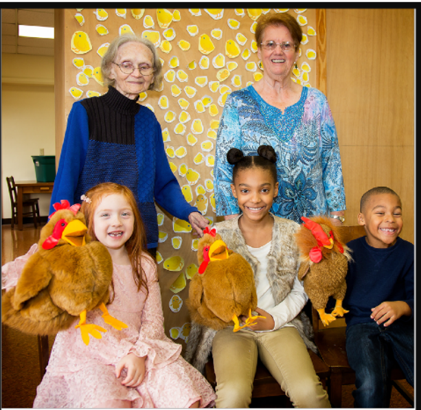
Children's Sunday School Chicken Project