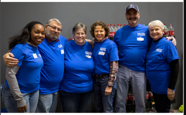
Bikes and Bibles - December 2018